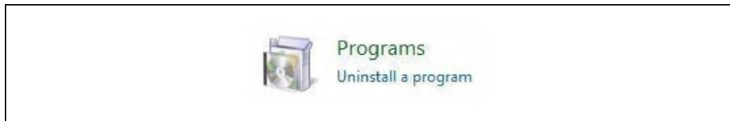
Figure 2. Uninstall a program